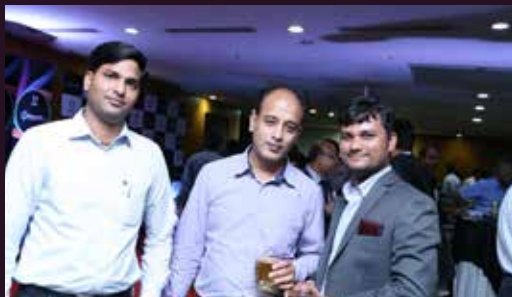
NETWORKING RECEPTION & DINNER