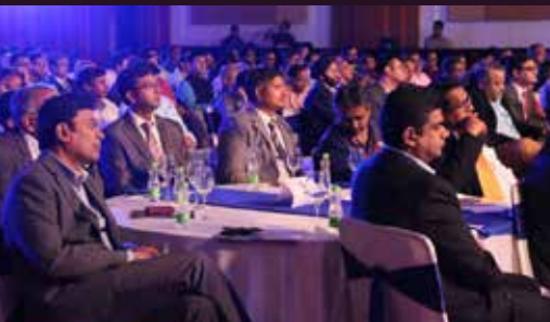
AUDIENCE OF 350+ INDUSTRY LEADERS