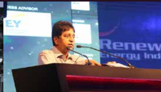
INSIGHTS BY INDUSTRY LEADERS