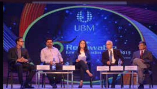
TELEVISED PANEL DISCUSSION